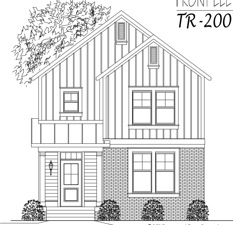
FRONT ELEVATION A TR-2009 II Guest Rm. Option